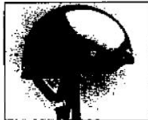
Half Shell (FIGURE 03)